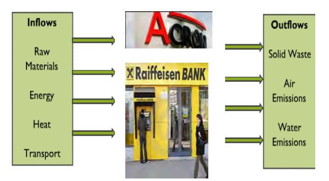
Figure. 4. Environmental-energetic analysis of the process [2].

Environmental-energetic analysis of the process which is the base for Life cycle assessment (LCA) is the same for the bank and steelwork (Figure 4).