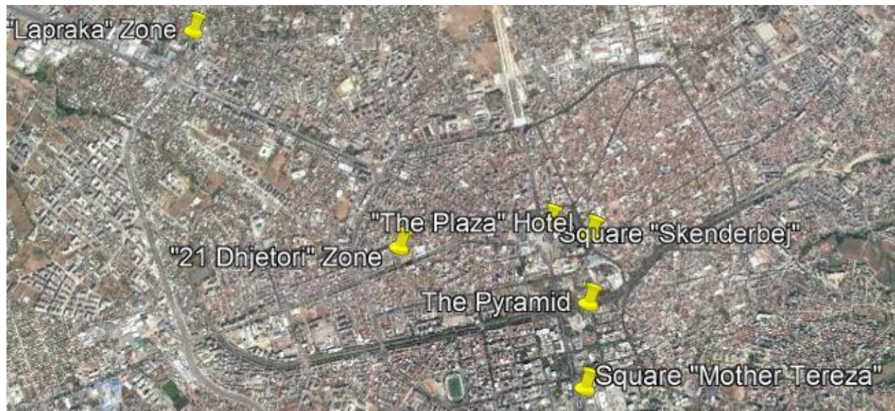
Figure 2. The obtained from www.earth.google.com map shows the points where noise measurements are performed

The Figure 2 shows the map obtained from www.earth.google.com which gives the positions where the measurements are made.