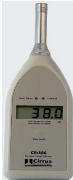
Figure 1. The presentation of a noise level meter that is used to measure the noise level in Tirana

The geographic points in which the measurements are made to determine the noise level in question are as given in the Table 1: