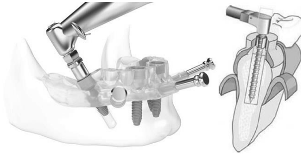
Figure 1. An example of insertion of the dental implant into the jawbone [2].

The thermal properties of dentine and tooth enamel affects the rate of response of the tooth nervous system to the temperature changes to which the tooth is exposed on a daily basis. In addition to strength and aesthetic requirements, artificial dental materials must also provide a similar thermal protection for the tooth pulp. Likewise, implants and artificial tooth crowns must transfer similar heat flow to the bone as is transferred by a natural tooth, which has a strong influence on the patient's general acceptance of the foreign body (Figure 1).