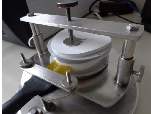
Figure 2. Sensor (Kapton) sandwiched between two halves of a sample during measurement

Hot disk measuring method is a transient plane source technique (TPS). Based on the theory of TPS, instrument utilizes a sensor element in the shape of 10 \mu\text{m} thick double spiral (Figure 2), made by etching from pure nickel foil. Spiral is mechanically strengthened and electrically insulated on both sides by thin polyimide foil (Kapton ®Du Pont) for measurements up to 300 °C or mica foil for measurements up to 750 °C. Sensor acts both as a precise heat source and resistance thermometer for recording the time dependent temperature increase. During measurement of solids, encapsulated Ni-sensor is sandwiched between two halves of the sample and constant precise pre-set heating power is released by the sensor, followed by 200 resistance recording in a pre-set measuring time, from which the relation between time and temperature change is established. Based on time dependent temperature increase of the sensor, thermal properties of the tested material are calculated.